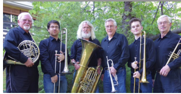
Gold Country Brass folk and stage favorites