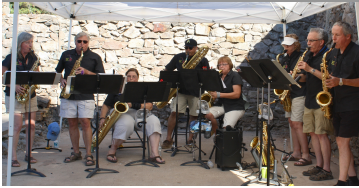
Blended Metal Saxophones jazz, folk, and pop hits