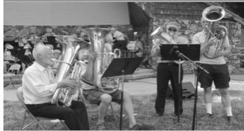
TUBAMONIUM! pop and folk tunes