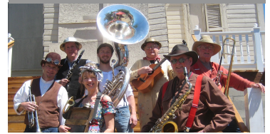
Stamp Mill Stompers Dixieland and early jazz