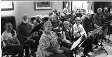
Clarinet Club classical, folk, and ballads