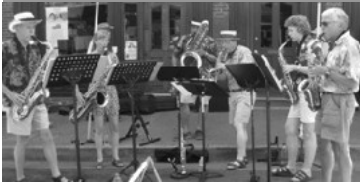
Blended Metal Saxophones jazz, folk, and pop hits