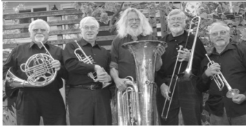
Gold Country Brass folk and stage favorites